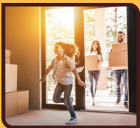
Homes for Heroes Page 5